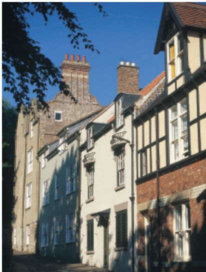
Dun Cow Lane takes its name from the panel on the north-west turret of the Chapel of the Nine Altars.