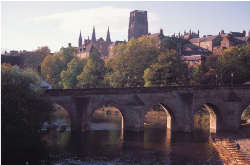
Elvet Bridge and Durham Cathedral.