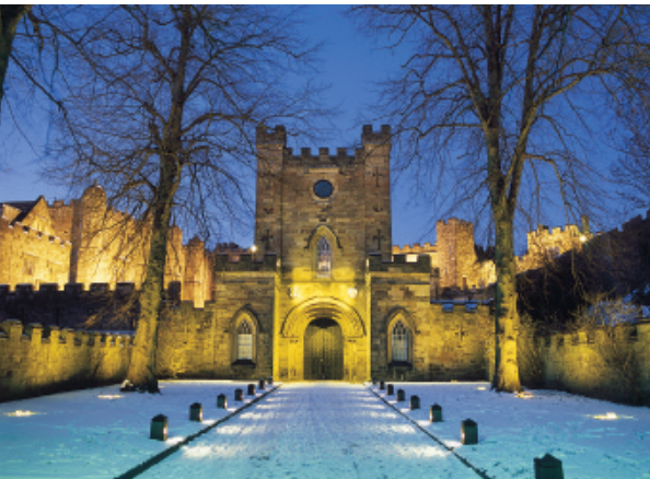
The Gatehouse, Durham Castle.